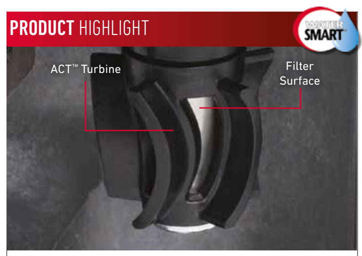
The P-220S Scrubber Series Valves Feature Toro's Patented ACT™ (Active Cleansing Technology) system

The ACT system's durable turbine is in constant rotation, which in turn keeps the metering and filtration area free of dirt and algae build-up. The turbine is constructed of materials resistant to chlorine, chloramines, and ozone, thereby keeping the valve operating at peak performance.