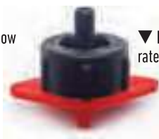
▼ Red Base nominal flow rate 8 l/h