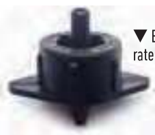
▼ Black Base nominal flow rate 4 l/h