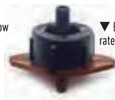
▼ Brown Base nominal flow rate 16 l/h